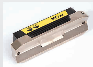
Precision ground prismatic base. Two holes for personal adaptations and brackets.