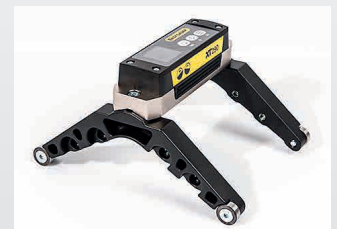
Legs for measurement on cylindrical surfaces with diameters larger than 2.2" [55 mm]. Accessory, Part No. 12-0901.

Easy-Laser® is manufactured by Easy-Laser AB, Alfagatan 6, SE-431 49 Mölndal, Sweden Tel +46 31 708 63 00, Fax +46 31 708 63 50, e-mail: info@easylaser.com, www.easylaser.com © 2023 Easy-Laser AB. We reserve the right to make changes without prior notification. Easy-Laser® is a registered trademark of Easy-Laser AB. Apple, the Apple logo, iPhone, and iPod touch are trademarks of Apple Inc., registered in the U.S. and other countries. App Store is a service mark of Apple Inc. 05-0984 rev3