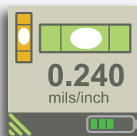
Clear display on XT290. Live values and graphics.

Align with live values, document as PDF. (XT Alignment app for iOS and Android. Values/Level program.)